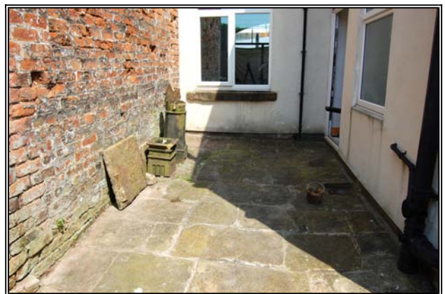
Rear Yard Front