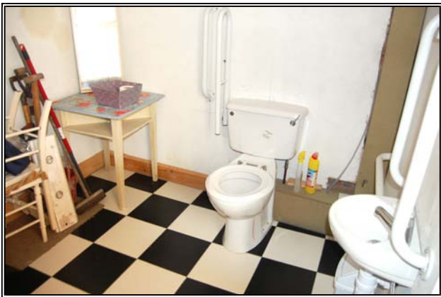
Ground Floor WC