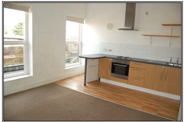
First Floor Flat Lounge and Kitchen