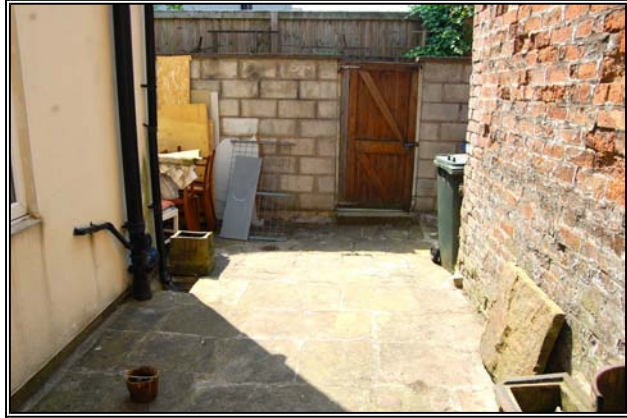
Rear Yard Rear