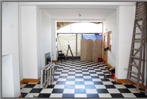
Ground Floor Shop Front