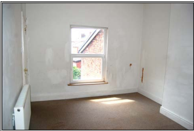
First Floor Flat Bedroom