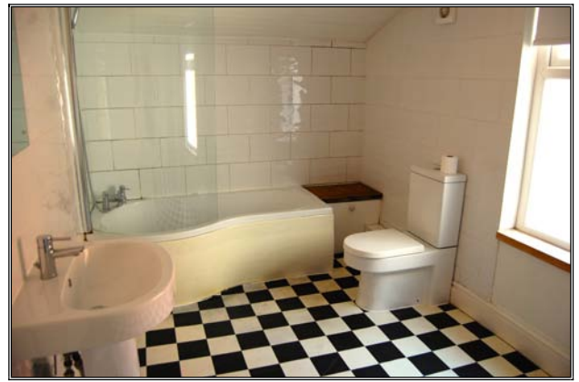
First Floor Flat Bathroom